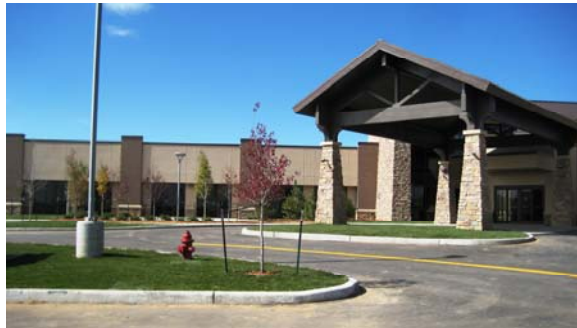
The Memorial Hospital

The future of healthcare in Moffat County is also impressive. After nearly 60 years at the same facility, The Memorial Hospital has moved to its new location at 750 Hospital Loop, in west Craig. Completed on budget and ahead of schedule, it measures 77,258 square feet. Like Grand River, it was designed with patient security, privacy and comfort at heart. Features include expanded surgical space, state-of-the-art technological advances, intimate waiting spaces and warm, comforting interior design.