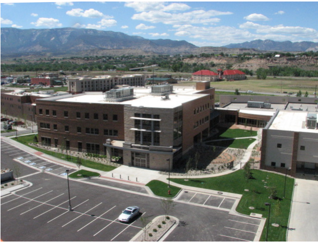
Grand River Medical Center

Two WHA members have recently celebrated new facility openings. In July, Grand River Hospital District opened the new addition to their campus, and The Memorial Hospital in Craig moved into their new facility on November 12 th .